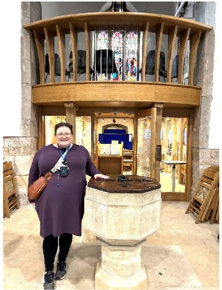
I am standing next to the baptismal font where John and Charles Wesley and their siblings were baptized at St. Andrew's Parish Church in Epworth where their father, Samuel, was the priest.