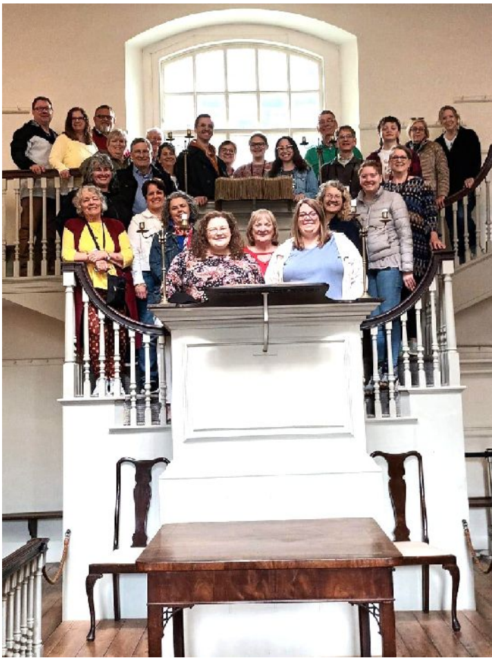
The group of clergy I traveled with standing in Wesley's pulpit in the New Room in Bristol.